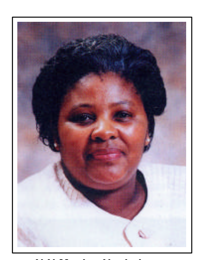
N N Mapisa-Nqakula Deputy Minister of Home Affairs